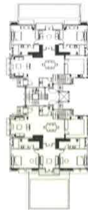
GROUND FLOOR LAYOUT